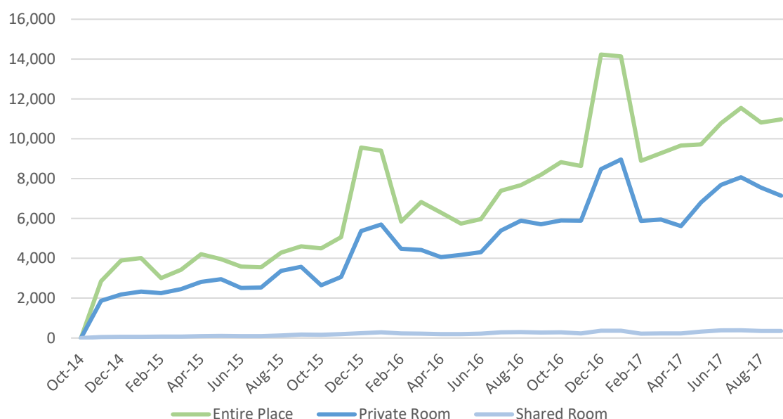
Figure 1 - total available listings in Sydney from 2014 to present 4

The following section is underpinned by data sourced from Airdna, a market watcher that monitors the listings available on Airbnb. While Airbnb is not the only platform offering STHL it is certainly the market leader and trends can be extrapolated from this data.